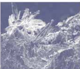
Asbestos Fibres on a Broken AC Sheet. SEM magnification 200x (Dyczek, 2004:8).