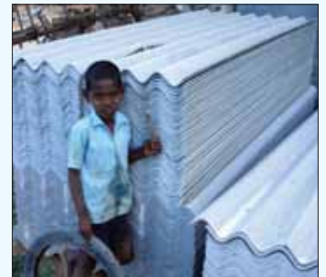
Typical display of corrugated AC roofing for Sale, Kothanur, Greater Bangalore (Reesearcher, Supplier Survey, February 3rd, 2006).