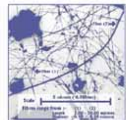
Straight Chrysotile Fibres in AC, magnification x 6500 (OEDA, 2002:2).

A key issue in the debate surrounding the carcinogenic potential of chrysotile centers on the issue of fiber length and shape. Short fibers are thought to penetrate the human body less than fibers that are long. Regarded as less hazardous in terms of ingestion than straight fibers, it has been claimed by pro-asbestos proponents that curly fibers are too curly to penetrate into lung tissue (OEDA, 2006). However, further studies have revealed that chrysotile fibers can be both long and straight, as evidenced above. Added to that, other studies have revealed that short fibers are able to penetrate more deeply into the lungs, therefore causing greater problems than first thought (Suzuki, GAC, 2004:27). Regardless, the length and relative dimensions of chrysotile fibers has been found to differ in AC roofing (Dyczek, 2004:8).