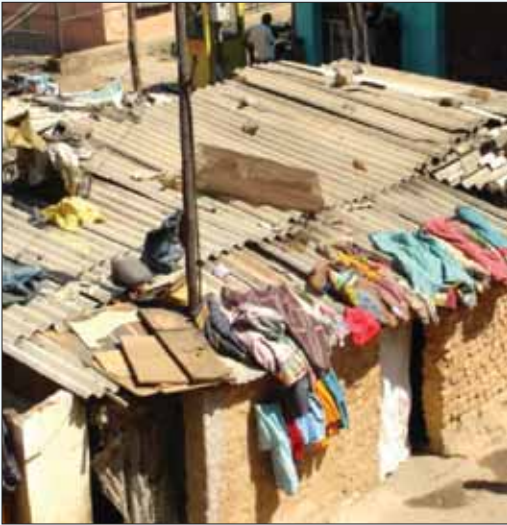
Typical AC roofing in New Lingarajapuram, Bangalore. Note lack of ventilation apart from that available by using the doorway.