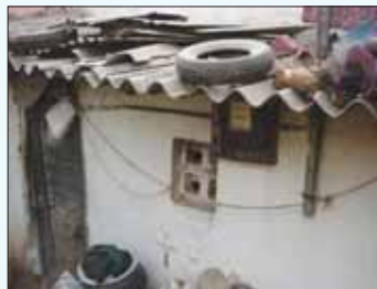
Typical exterior condition of AC roofing in New Lingarajapuram. Note the broken AC roofing sheets, low roof height and the ventilation 'window' – a typical size in the homes of New Lingarajapuram.