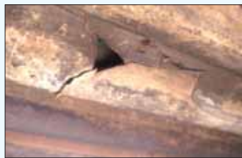
Smoke damaged and cracked AC roofing (same dwelling as above).