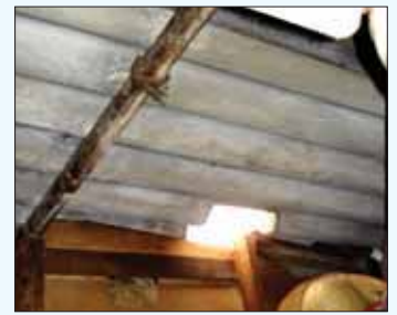
Homemade skylight cut into AC roofing, the cutting of which releases harmful chrysotile fibres into the environment. The roof has been previously painted with white emulsion paint which deteriorates rapidly, often showing signs of discolouration and mould. Note the contrast in ceiling colour when compared to white ceiling fan (top right).