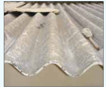
Exterior AC roofing in reasonable condition. Note surface weathering.