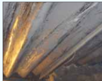
Charred and cracked AC roofing after long-term use (same dwelling as above).