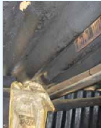
Pitting and smoke damage on AC roofing after long-term use (same dwelling as above).