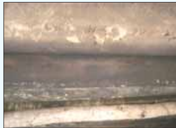
Flaking and pitted AC roofing, resulting from smoke damage. House was newly built and had been occupied for one year at the time of survey.