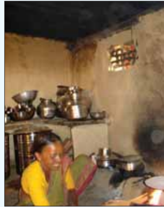
The effects of cooking over an open wood fire indoors. Note the ventilation 'window,' and the condition of the smoke blackened walls and AC ceiling. The occupants have lived in this dwelling for 16 years.